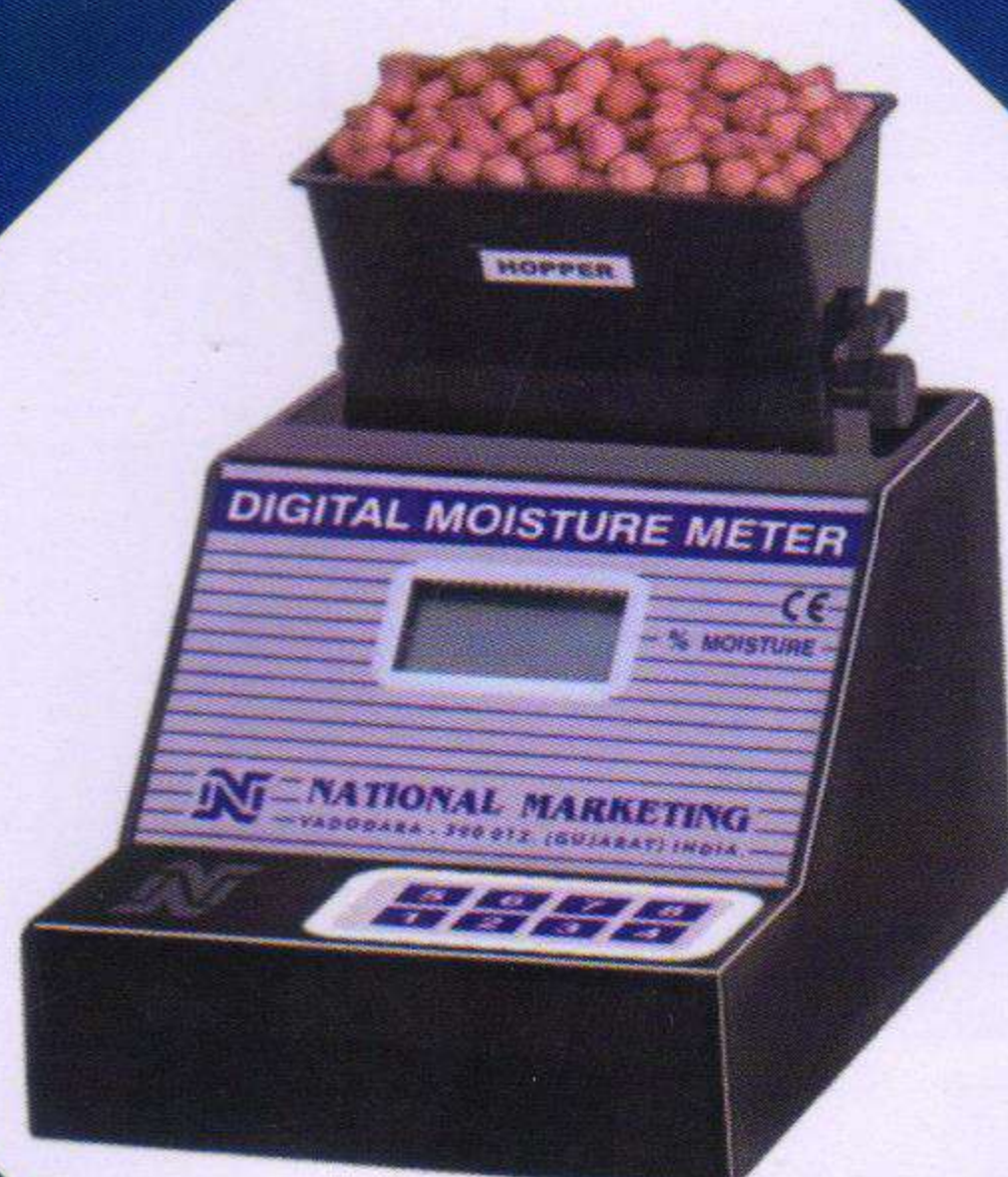
Digital Moisture Meter

SALES | SERVICE CALIBRATION | AMC TAILORED MADE EQUIPMENTS CAN BE DESIGNED